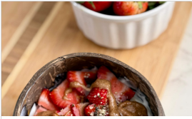
Strawberry Yogurt Parfait