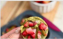
Strawberry Spinach Muffins