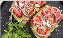
Strawberry & Feta Avocado Toast